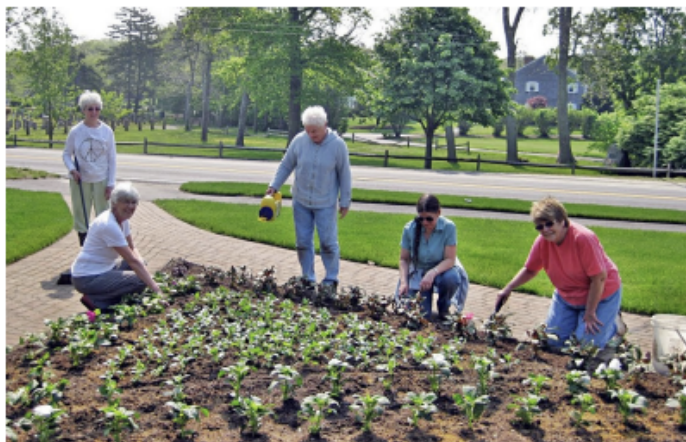
Village Garden Club of Dennis planting the flower garden at Nobscussett Park.

This mailing is our annual appeal for donations needed to care for our properties. For those of you who may be new to Dennis, you might be wondering which properties we own and care for. We own and take care of the Dennis Village Green and the Bandstand at the corner of Route 6A and Old Bass River Road, also Soldiers Field along 6A in front of the Burying Ground. We also own and care for both the Ball Field and the Playground at the corner of New Boston Road and 6A. Additionally we maintain Nobscussett Park at the corner of Nobscussett Road and 6A, the new adjacent Nobscussett parking lot, and the William O. King Memorial all owned by the Town. Our maintenance bills are high and we accomplish all of it thanks to you and many annual donors. We promise to use your contributions wisely. In 2022 we have a long list of projects we would like to address including: replacing all the aging split rail fencing around the Playground and around Soldiers Field, replacing the 2 weathered game tables at the Park, replacing 2 fallen trees on Soldiers Field, replacing the weathered WW II sign on the Village Green and replacing the broken flagpole on the Village Green. With your contributions we can do it all!