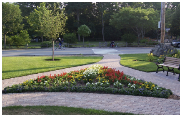
The garden in bloom