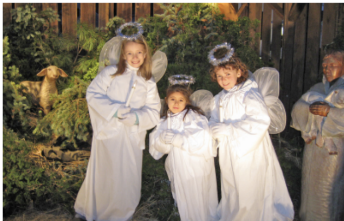
Annual live crèche pageant

Donations may be paid by check or by using PayPal through our website. All donors become Village Improvement Society members for the year, and donations are tax deductible under our non-profit 501c(3) status.