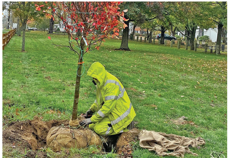
Replacing storm damaged trees

C urrently, an issue of grave concern for the VIS as abutters is the proposed high-density 40B development by Paul Sullivan and Chuck Deluga of Betterwood Homes. The plan calls for the construction of 20 condo units surrounding their office, and across Hope Lane and impacts the already overburdened intersection at Old Bass River Road.