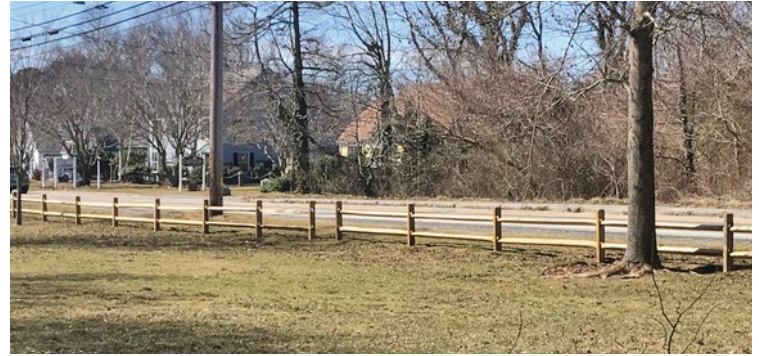
New fencing along Route 6A

And so we ask you once more in this year's annual appeal for your generosity in helping us fulfill our vision. We are a 501(c)3 charity, of course, and your fully tax-deductible contribution in any amount—by check or by using PayPal through VillageImprovementSocietyofDennisMA.com —will ensure that the Dennis we know and love today will become even more memorable in the months and years ahead: you have our word on that. Thank you, in advance, for your support.